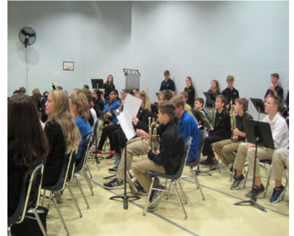
Seventh and Eighth Graders listening to music.