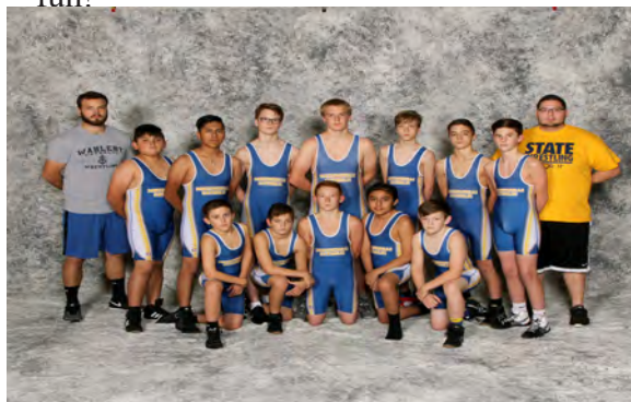
Wrestling Team 2017/2018

With the support of Mazzuchelli, we can continue to have a great season next year! The sport wrestling seems to be a good fit for kids who want to stay in shape and have fun!